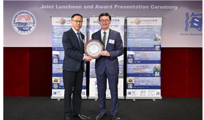
Orient Overseas Container Line Ltd. receives the award for the shipowner placing the most GT on the HKSR in 2025