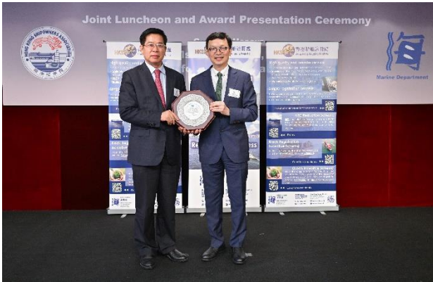
China COSCO Shipping Corporation Limited receives the award for the shipowner with the highest GT on the HKSR in 2025