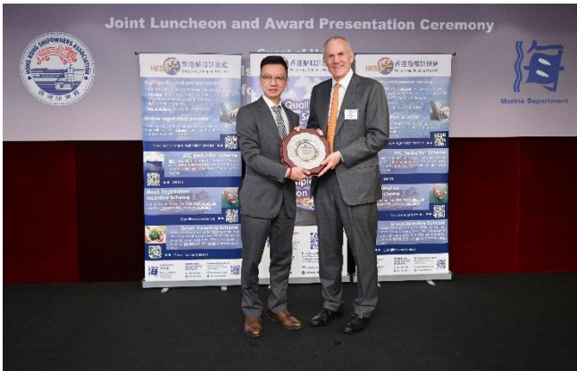
Maersk A/S receives an award for Bravery for the year of 2025 on behalf of all the crew members of MV NICOLAI MAERSK