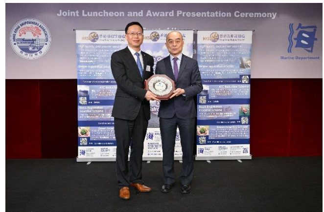
China Merchants Energy Shipping Co., Ltd. receives the 2026 MD-WMMF ESG Award