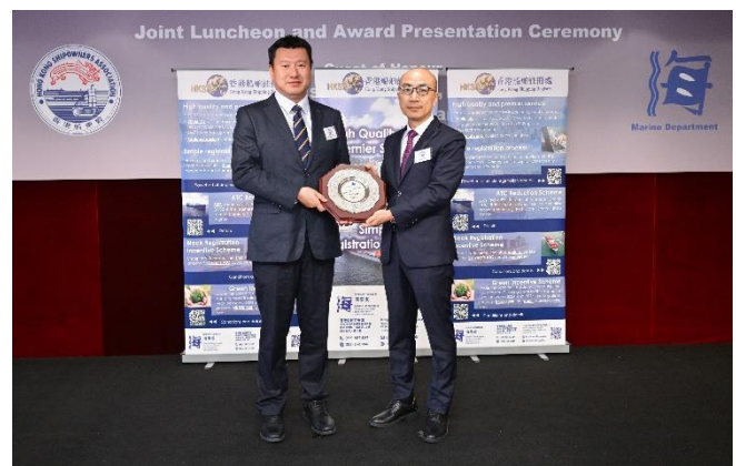
Hong Kong Ming Wah Ship Management Company Limited receives an award for outstanding performance in PSC for the year of 2025