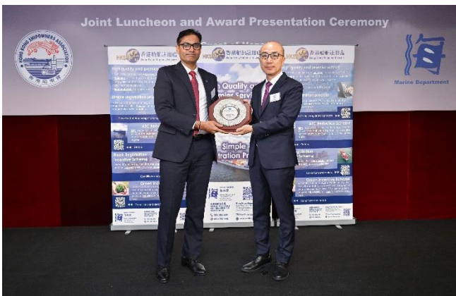
Pacific Basin Shipping (HK) Limited receives an award for outstanding performance in PSC for the year of 2025