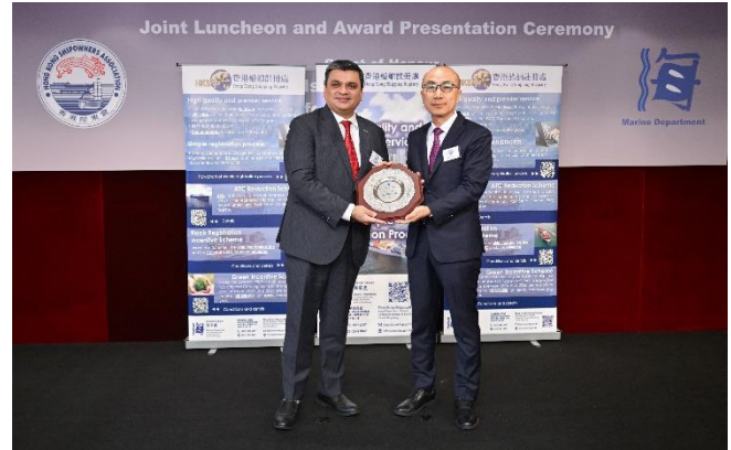
Anglo-Eastern Ship Management Limited receives an award for outstanding performance in PSC for the year of 2025