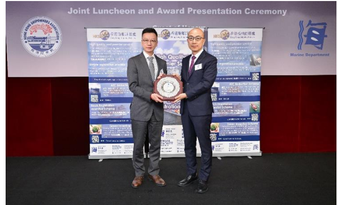
Maersk A/S receives an award for outstanding performance in PSC for the year of 2025