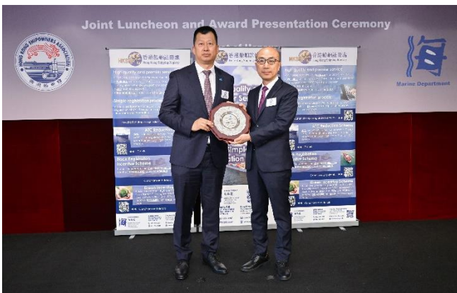
Ocean Longevity Shipping & Management Co., Ltd. receives an award for outstanding performance in PSC for the year of 2025