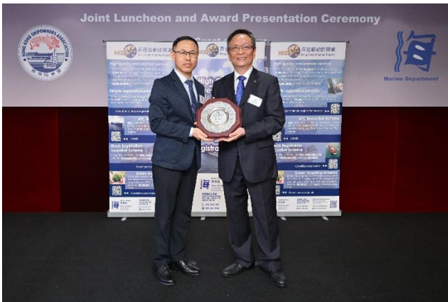
Orient Overseas Container Line Ltd. receives an award for Company Recruiting the Most Hong Kong Sea-going Cadets in 2025