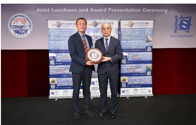
COSCO Shipping Holdings Co., Ltd. receives the 2026 MD-WMMF ESG Award