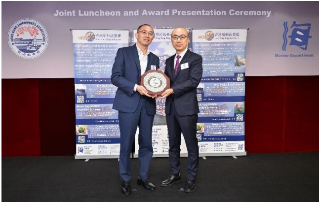
Jiangsu Ocean Shipping Bulk Company Limited receives an award for outstanding performance in PSC for the year of 2025