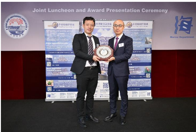
COSCO Shipping Bulk Co., Ltd. receives an award for outstanding performance in PSC for the year of 2025