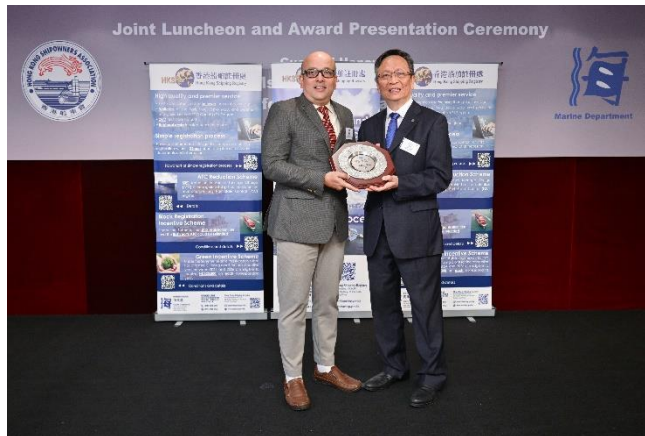
Pacific Basin Shipping (HK) Limited receives an award for Company Recruiting the Most Hong Kong Sea-going Cadets in 2025