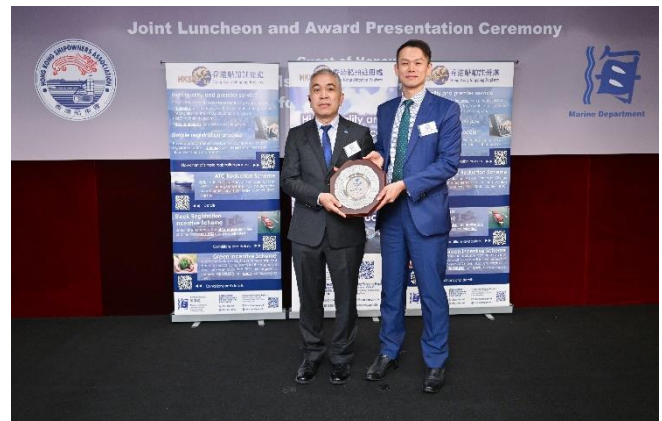
Pacific Basin Shipping (HK) Limited receives the Green Fleet Award in 2025