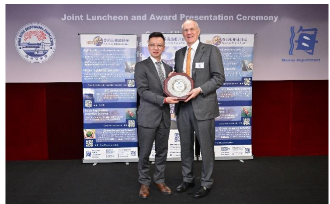
Maersk A/S receives an award for Bravery for the year of 2025 on behalf of all the crew members of MV MAERSK CHACHAI