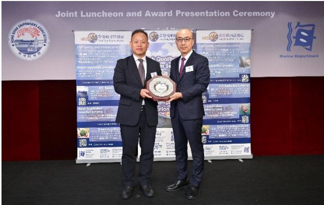
SITC Shipping Management (Shanghai) Co., Ltd. receives an award for outstanding performance in PSC for the year of 2025