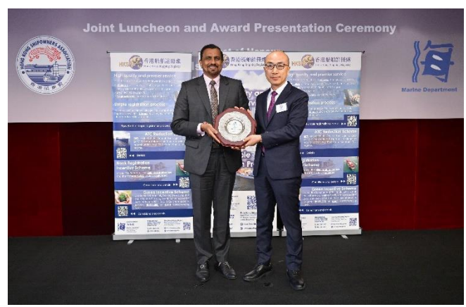
Fleet Management Limited receives an award for outstanding performance in PSC for the year of 2025