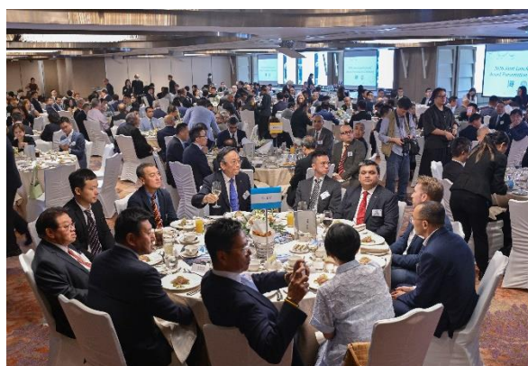
[Event photo 3: The Marine Department and the Hong Kong Shipowners Association jointly organised the “2026 Joint Luncheon cum Award Presentation Ceremony”. Approximately 230 representatives from the maritime sector and distinguished guests attended. ]