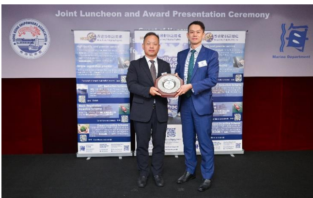
SITC Shipping Management (Shanghai) Co., Ltd. receives the Green Fleet Award in 2025