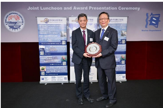
Wah Kwong Ship Management (Hong Kong) Ltd. receives an award for Company Recruiting the Most Hong Kong Sea-going Cadets in 2025