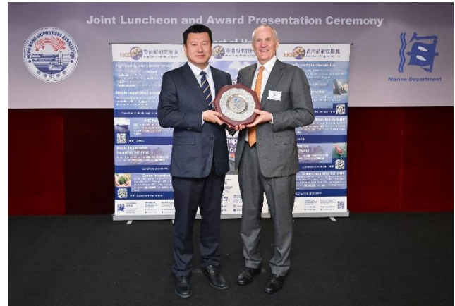
Hong Kong Ming Wah Shipping Company Ltd. receives an award for Bravery for the year of 2025 on behalf of all the crew members of MV ORE HONG KONG