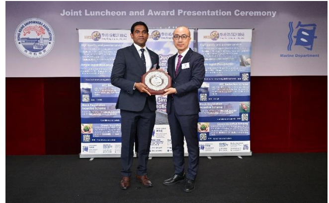
Wah Kwong Ship Management (Hong Kong) Limited receives an award for outstanding performance in PSC for the year of 2025