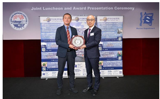
Shanghai Ocean Shipping Co., Ltd. receives an award for outstanding performance in PSC for the year of 2025