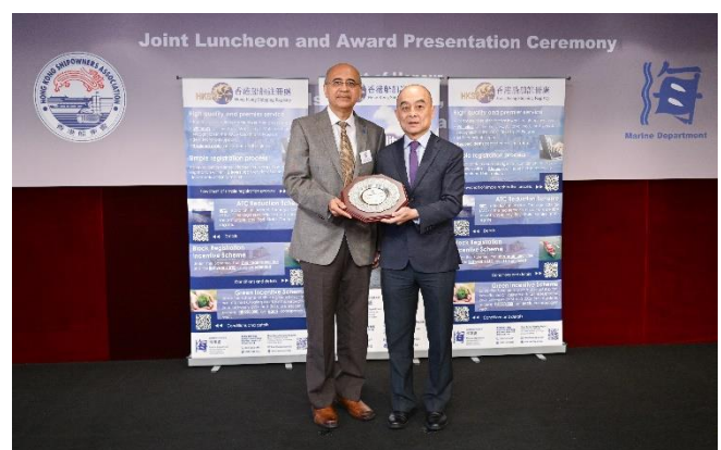
Pacific Basin Shipping Ltd. receives the 2026 MD-WMMF ESG Award