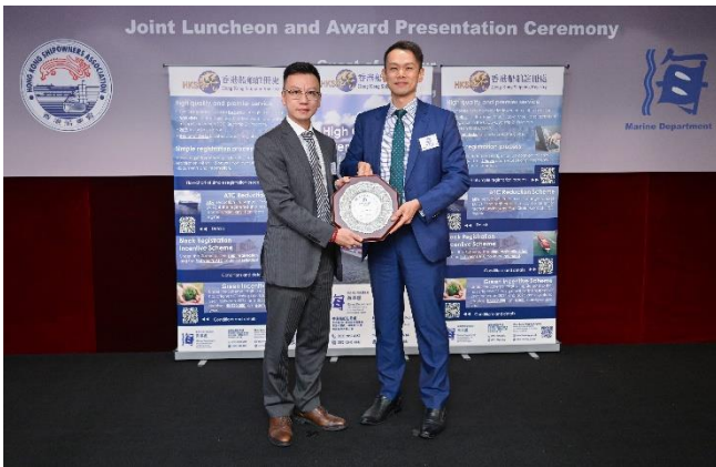
Maersk A/S receives the Green Fleet Award in 2025