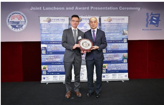
A.P. Moller - Maersk A/S receives the 2026 MD-WMMF ESG Award