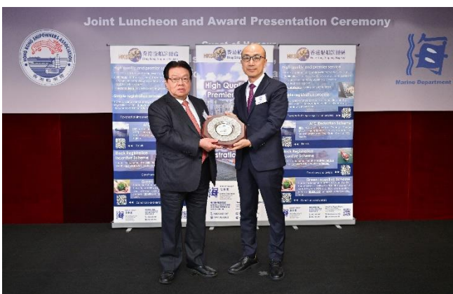
Goldbeam International Ltd. receives an award for outstanding performance in PSC for the year of 2025