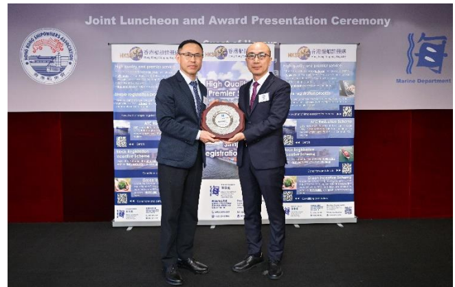
Orient Overseas Container Line Ltd. receives an award for outstanding performance in PSC for the year of 2025