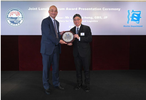
China COSCO SHIPPING Corporation Limited receives the award for the company with the highest GT on the HKSR in 2022