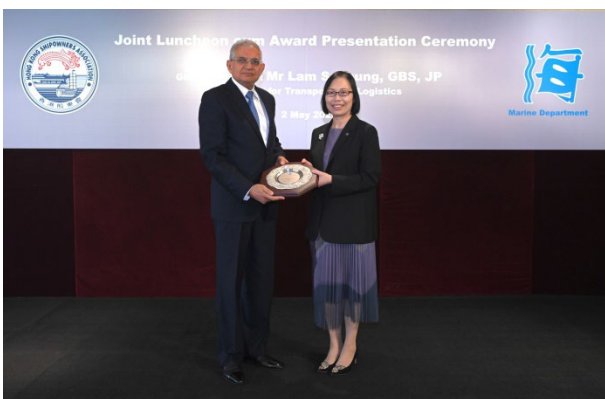
Fleet Management Limited receives an award for outstanding performance in PSC for the year of 2022