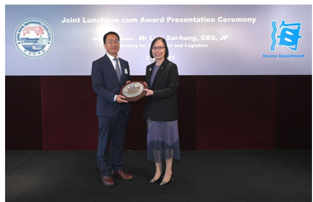
Hong Kong Ming Wah Ship Management Company Limited receives an award for outstanding performance in PSC for the year of 2022