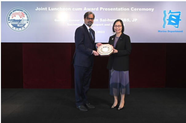
Pacific Basin Shipping (HK) Limited receives an award for outstanding performance in PSC for the year of 2022