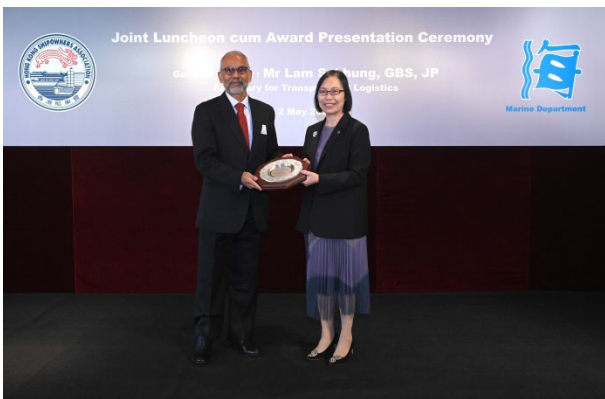
Seaspan Ship Management Ltd. receives an award for outstanding performance in PSC for the year of 2022