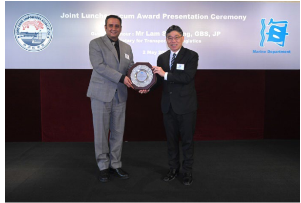
Seaspan Corporation receives the award for the company which placed the most GT on the HKSR in 2022