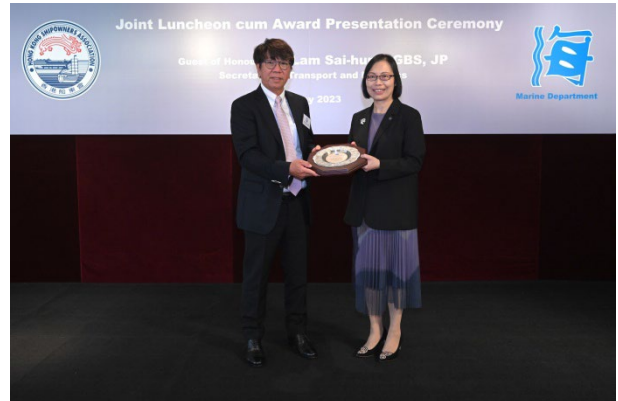
Raffles Technical Services Pte. Ltd. receives an award for outstanding performance in PSC for the year of 2022