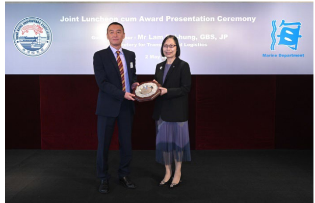
Shanghai Ocean Shipping Co., Ltd. receives an award for outstanding performance in PSC for the year of 2022