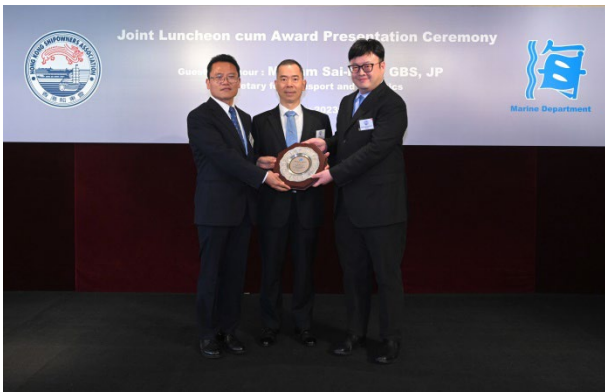
Pacific Basin Shipping (HK) Limited receives an award for Bravery for the year of 2022 on behalf of all the crew members of MV EASTERN CAPE