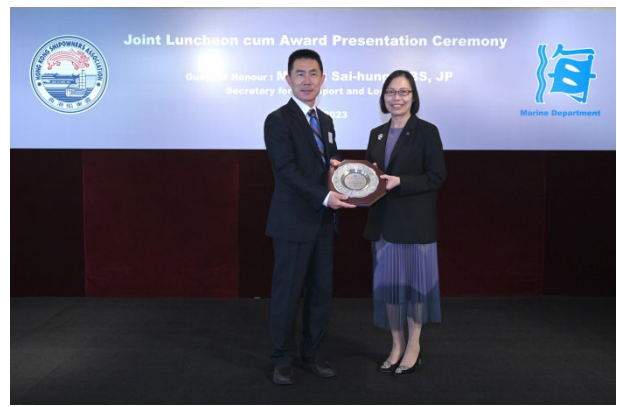
COSCO Shipping Bulk Co., Ltd. receives an award for outstanding performance in PSC for the year of 2022