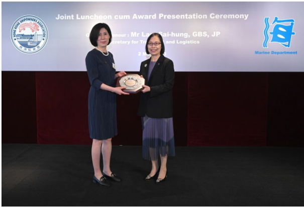
SITC Shipping Management (Shanghai) Co., Ltd. receives an award for outstanding performance in PSC for the year of 2022