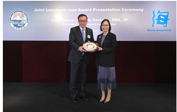
Orient Overseas Container Line Ltd. receives an award for outstanding performance in PSC for the year of 2022