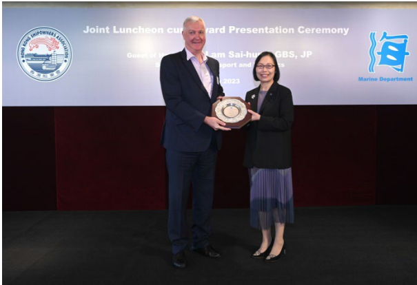
Maersk A/S receives an award for outstanding performance in PSC for the year of 2022