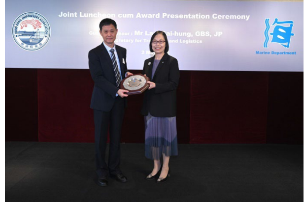
Wah Kwong Ship Management (HK) Ltd. receives an award for outstanding performance in PSC for the year of 2022