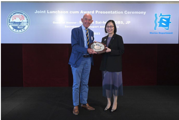
Anglo-Eastern Ship Management Limited receives an award for outstanding performance in PSC for the year of 2022