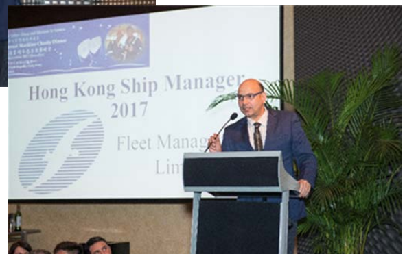
Hong Kong Ship Manager Award 2017 to Fleet Management Ltd