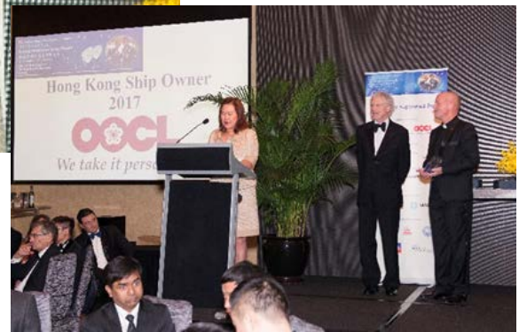
Hong Kong Ship Owner Award 2017 to OOCL