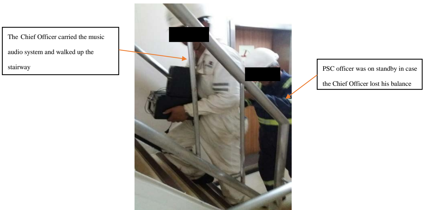
Figure 6 Simulation carried out during the PSC inspection