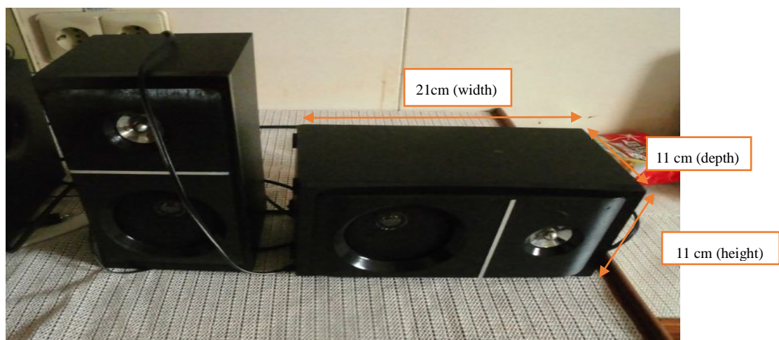
Figure 5 Two speakers of the music audio system