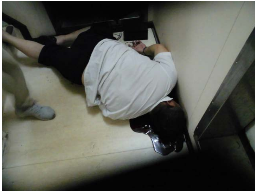
Figure 2 The bosun lying on A deck with his head in a pool of blood

3.9 At 0112 hours on 2 October 2017, the bosun received emergency treatment in a local hospital and was declared dead at 0122 hours.