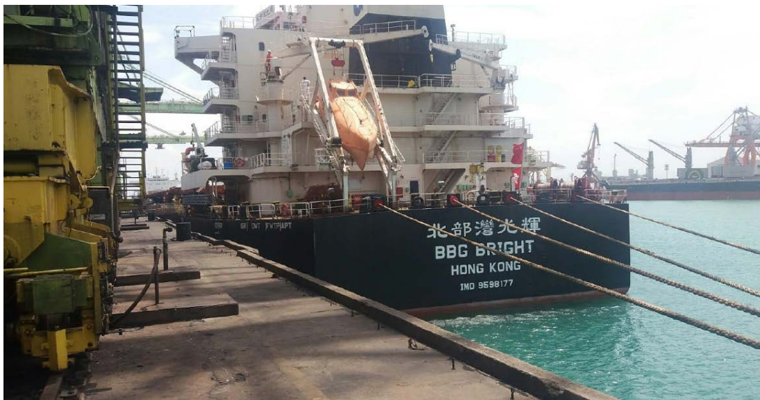
Figure 1 the vessel