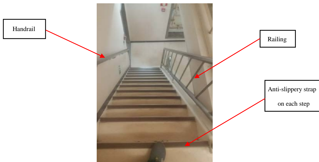
Figure 3 The stairway