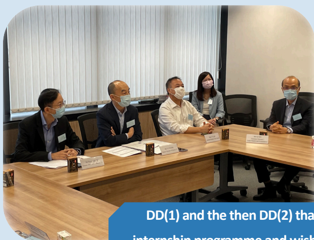
DD(1) and the then DD(2) thanked the interns for joining the summer internship programme and wished them success in future.