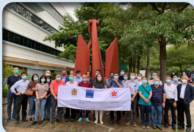
The fruitful visit concluded with the group photo taken in front of the anchor of "Seawise Giant", which used to be the world's largest crude carrier.

Marine Department, Government of Hong Kong Special Administrative Region Harbour Building, 38 Pier Road, Central, Hong Kong G.P.O. Box 4155 Enquiries: (852) 2542-3711 Fax: (852) 2541-7194, 2544-9241 Website: www.mardep.gov.hk Email: mdenquiry@mardep.gov.hk