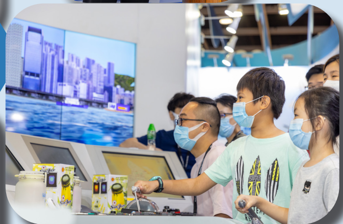
Students tried operating the ship simulator under the guidance of the staff.