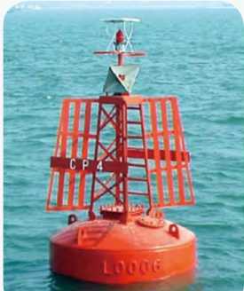
Port-hand lighted buoy

Generally used to mark the port side of well-defined channels