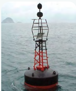
Isolated Danger lighted buoy

Not primarily to assist navigation but to indicate special features