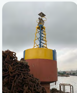
Emergency wreck marking lighted buoy

To station over dangers with navigable water around them