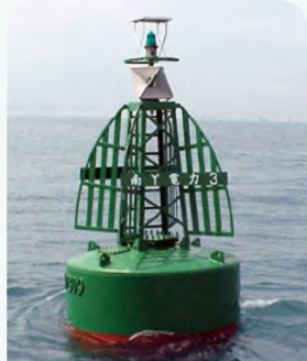
Starboard-hand lighted buoy

Generally used to mark the port side of well-defined channels