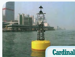
Cardinal lighted buoy

To indicate navigable water to the named side of the lighted buoy