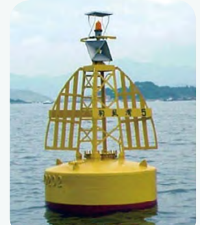
Special lighted buoy

Generally used to mark the middle of channel and landfall approach