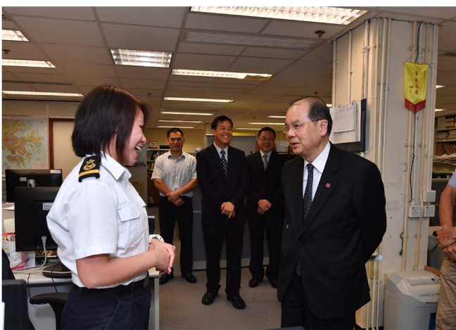
The Chief Secretary for Administration, Mr Matthew Cheung Kin-chung (second right), tours the Central Marine Office of the Marine Department and chats with the staff to better understand the daily work of the office, including processing licence applications and renewals for local vessels, and handling reports on departures and arrivals of river trade vessels and ocean-going vessels.

chatted with staff of the department and commended them for their commitment in applying professional knowledge and technical expertise to ensure smooth port operation and safety in Hong Kong waters. He encouraged them to continue making joint efforts to provide safe and quality maritime services for the industry and the public. 🌊