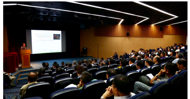
The 2017 Safety Afloat Educational Seminar was attended by almost 130 representatives from the shipping industries, water sport industries, and coxswains or vessel operators.

In addition, the MD plans to step up regulation on