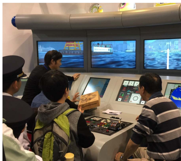
A visitor experiences steering a vessel in the harbour.