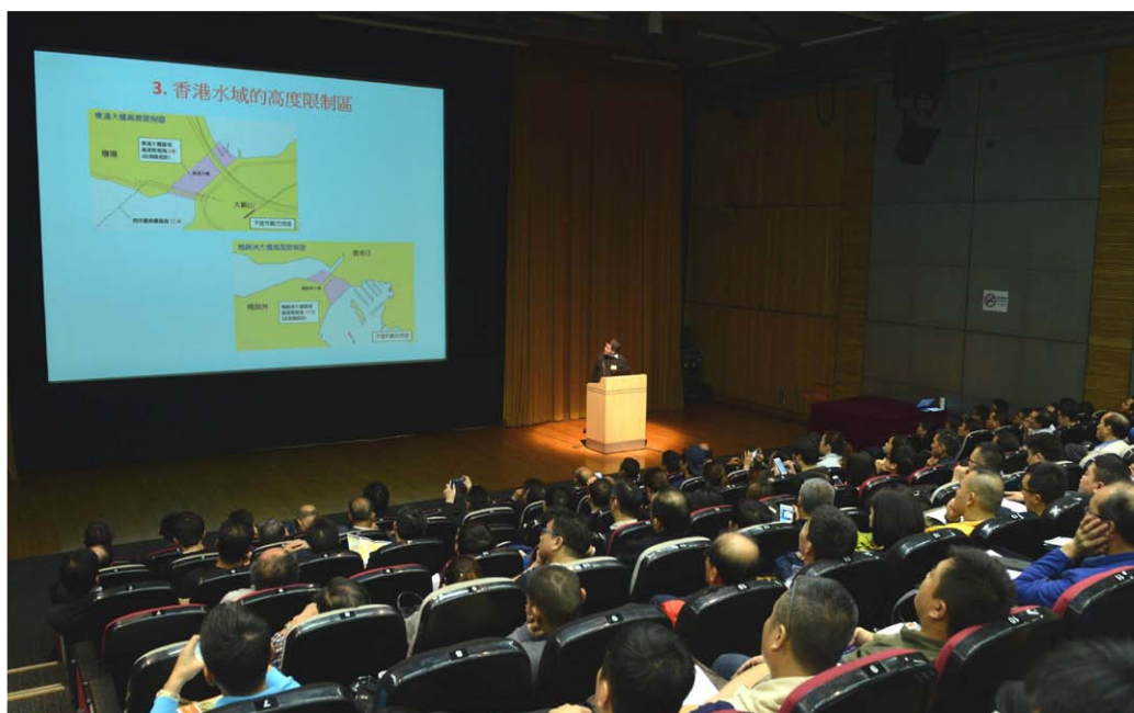
More than 180 representatives from the shipping industries, coxswains and operators of local vessels, as well as representatives of marine works projects attend the seminar.

The Marine Department (MD) held the Navigational Safety Seminar 2016 on January 6. More than 180 representatives from the shipping industries, coxswains and operators of local vessels, as well as representatives of marine works projects attended the seminar.