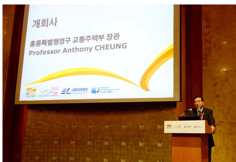
The Secretary for Transport and Housing, Professor Anthony Cheung Bing-leung, speaks at a luncheon seminar in Seoul, Korea.

During his stay in Seoul, Professor Cheung called on the Korean Minister of Land, Infrastructure and Transport, Mr Kang Ho-in. He also spoke at a business seminar co-organised by the Hong Kong Trade Development Council and the Hong Kong Economic and Trade Office in Tokyo on the infrastructural, institutional and geographical strengths of Hong Kong as a regional logistics hub. He