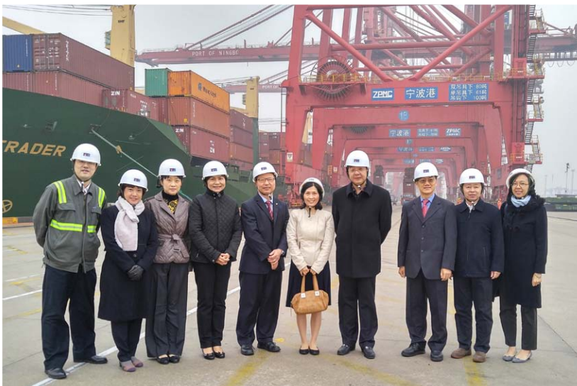
Members of the delegation are pictured with the senior management of the Ningbo-Zhoushan Port.