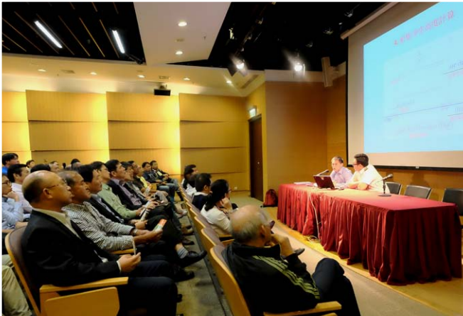
More than 130 representatives from the local tugboats and barges industries attend the seminar.

The Marine Department (MD) held a navigational safety seminar on November 2, 2015 to remind representatives of the local tugboats and barges industries of the points to notice when navigating in height restricted areas in Hong Kong waters.