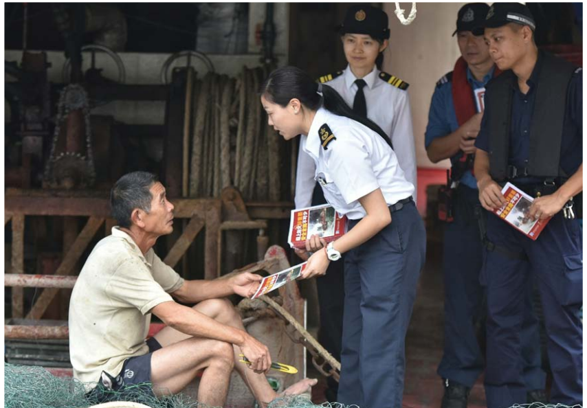
Officers of the MD and relevant departments conduct a joint inspection at the Shau Kei Wan Typhoon Shelter. Photo shows an MD officer distributing a promotional leaflet to a worker of a vessel to remind him to pay attention to fire safety on vessels.

In addition, the crew should follow appropriate fire prevention measures, including keeping a close watch on fire when cooking, using up-to-standard cooking stoves, ensuring no miscellaneous articles are placed near cooking appliances when cooking, and not placing an excessive amount of inflammable