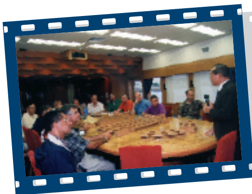
Legal eagles ... a delegation from the Guangzhou Maritime Judges Association paid a visit to the Marine Department.