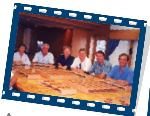
Brisbane Airport Corporation delegates on board VIP launch "Tin Hau".