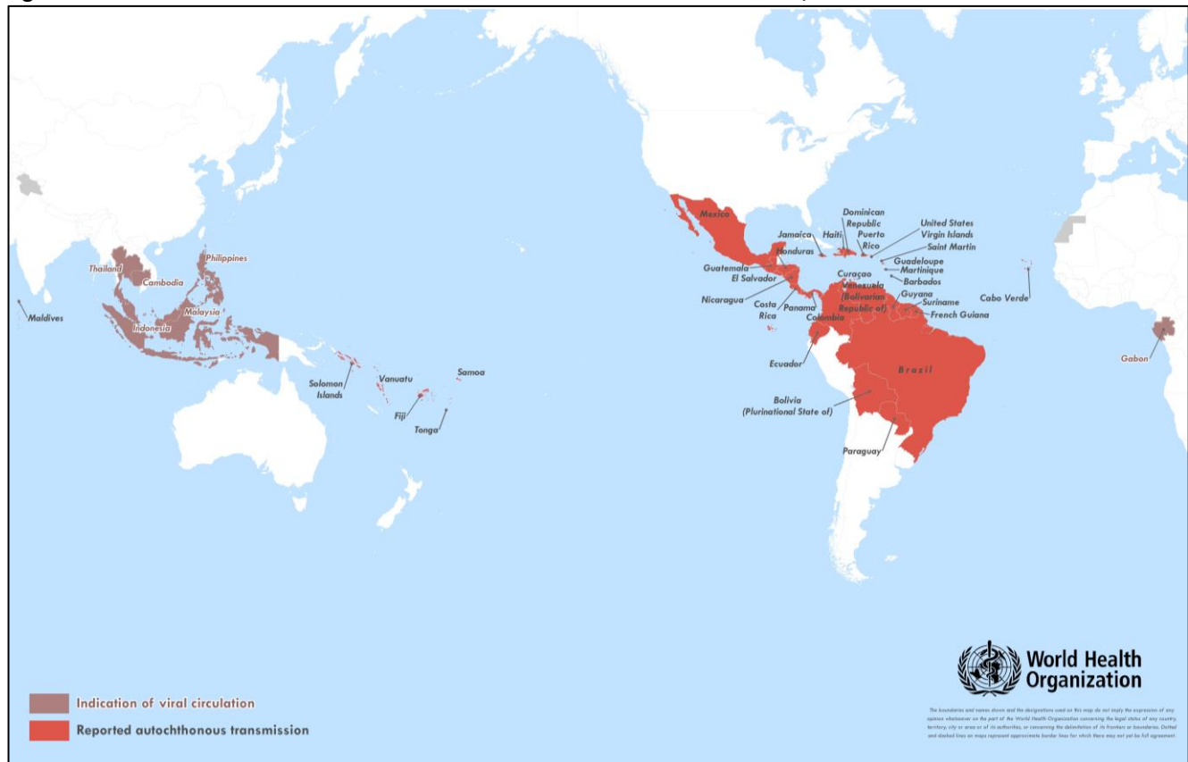
Figure 1: Countries and territories with autochthonous transmission of Zika virus, 2007 – 2016

The boundaries and names shown and the designations used on this map do not imply the expression of any opinion whatsoever on the part of the World Health Organization concerning the legal status of any country, territory, city or area or of its authorities, or concerning the delimitation of its frontiers or boundaries. Dotted and dashed lines on maps represent approximate border lines for which there may not yet be full agreement. Data as of 5 February 2016.