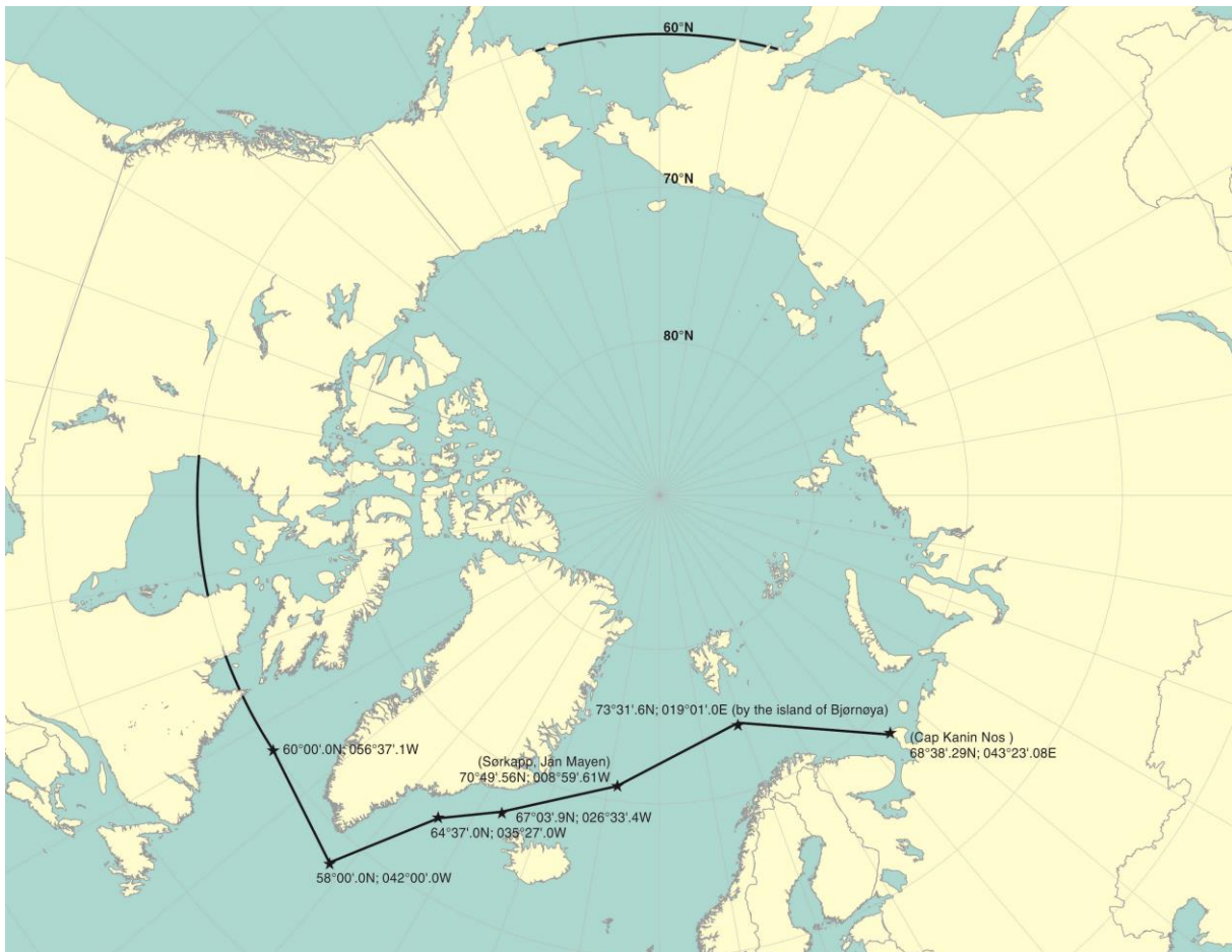
Figure 2 – Maximum extent of Arctic waters application 3