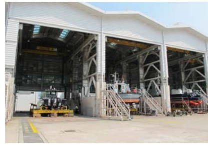
Covered Repair Sheds