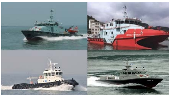
Major Mechanised Vessels