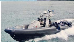
High Speed Craft