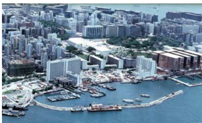
Old Government Dockyard at Canton Road