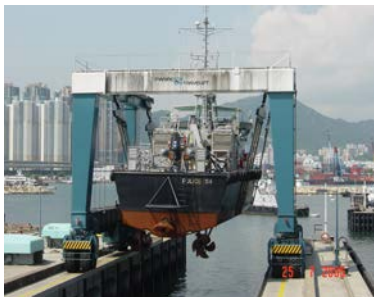
Lifting of Vessel