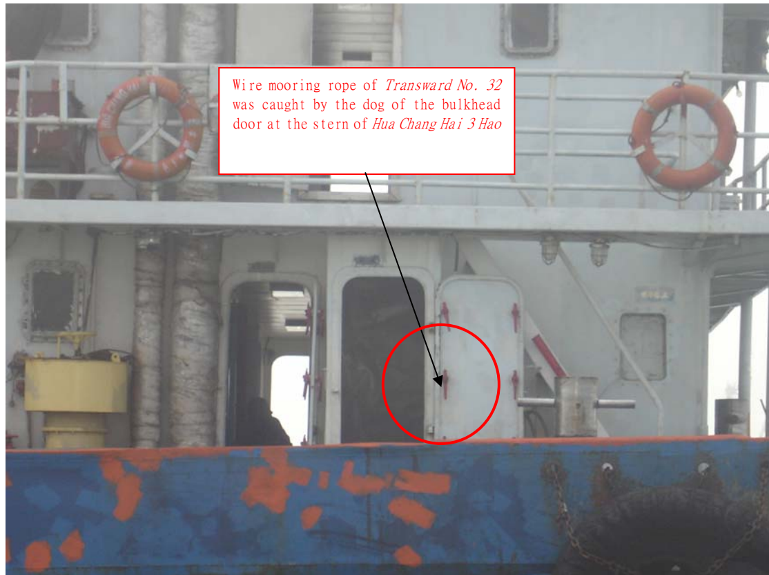
Figure 2 – Diagram showing the dog of the bulkhead door where the wire mooring rope of Transward No. 32 was caught