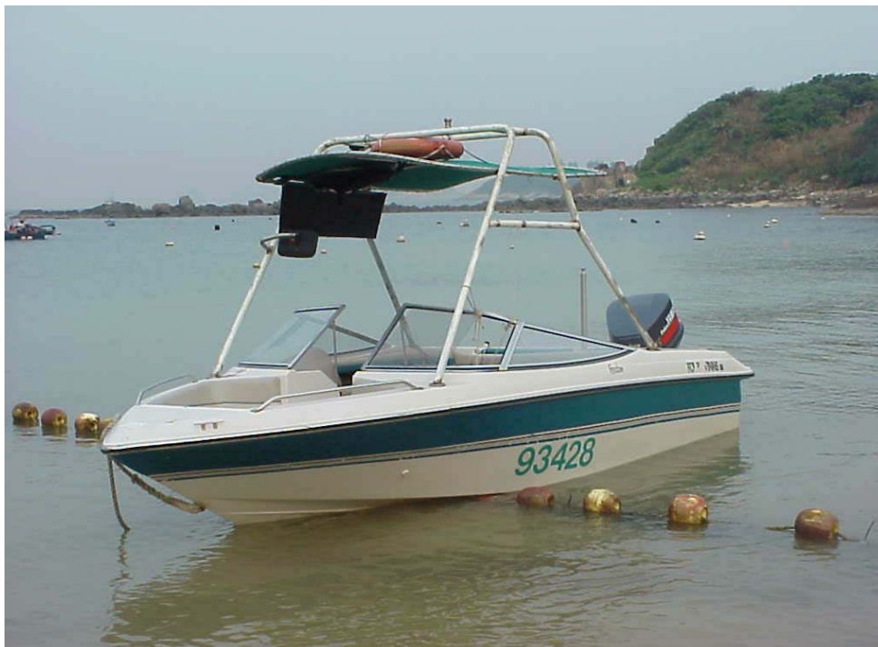
Figure 1 – Pleasure Vessel PV93428