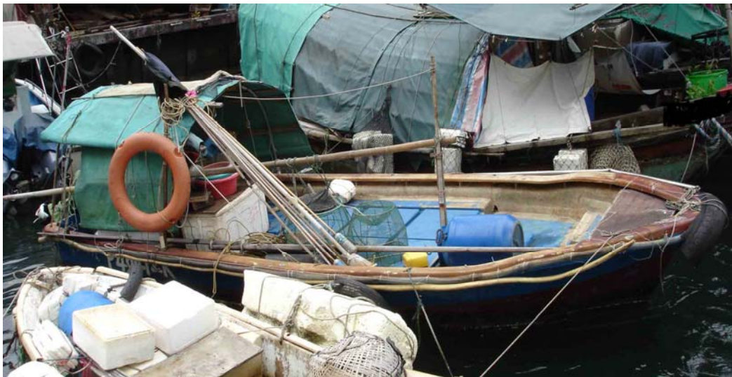
Figure 1 – Photograph of outboard open sampan P40412K