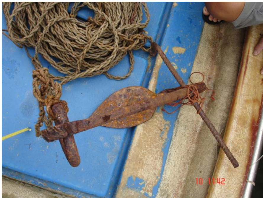
Fig. 3: The anchor of the Vessel

5.9 The Vessel was equipped with an anchor with a weight of about 7 kg (see figure 3). It was secured at the forward of the Vessel with a synthetic rope of about 90 feet in length. The rope was coiled on the deck of the Vessel . When anchoring, the Master had to lift up the anchor manually and dropped it into the water. During the course of operation, it is possible that he lost his balance on the slippery deck surfaces or the weight of the anchor threw off his balance when dropping the anchor. It is also possible that he was tripped and pulled by the anchor rope while it was running out.