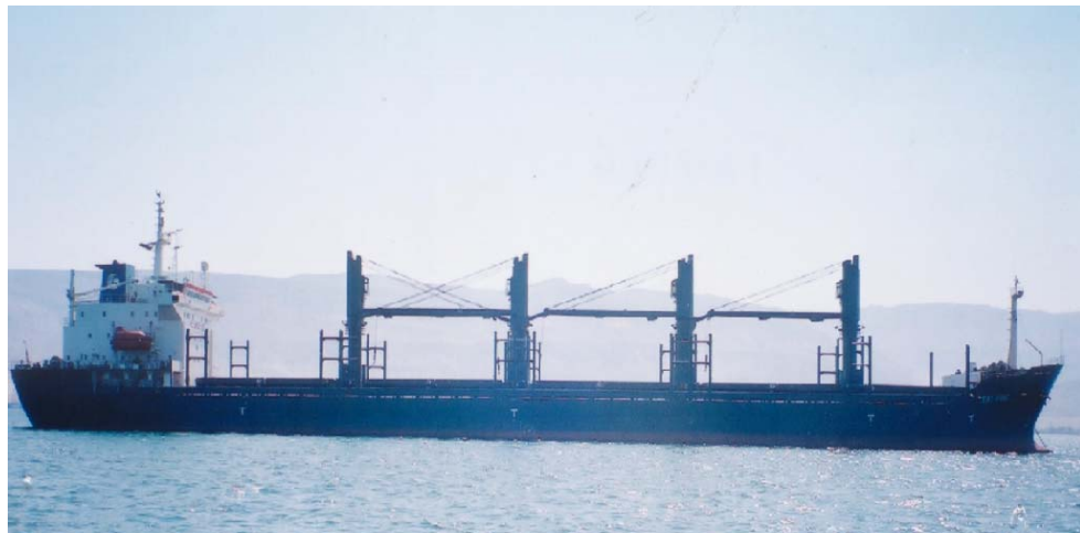
Fig. 1: Photo of m.v. " Tai Ping "

"Tai Ping" (hereinafter referred as the Vessel ), is a 5-hold bulk carrier built in 1996 by Guangzhou Shipyard International Co. Ltd. in China. The Vessel was owned by Rightlink Shipping Ltd. and managed by Fenwick Shipping Services Ltd.