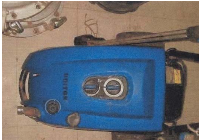
Fig. 3 The high-pressure water jet cleaning machine

Insulation test on the equipment was conducted by the Electrical Officer at 1600 on 22 July 2005 (four hours after the incident). The test results were as follows: