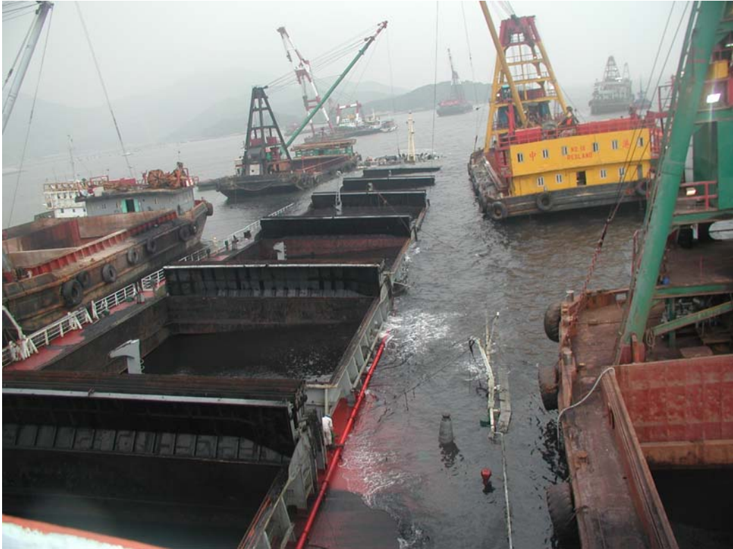
"Peng Yang" after grounding in Yam O