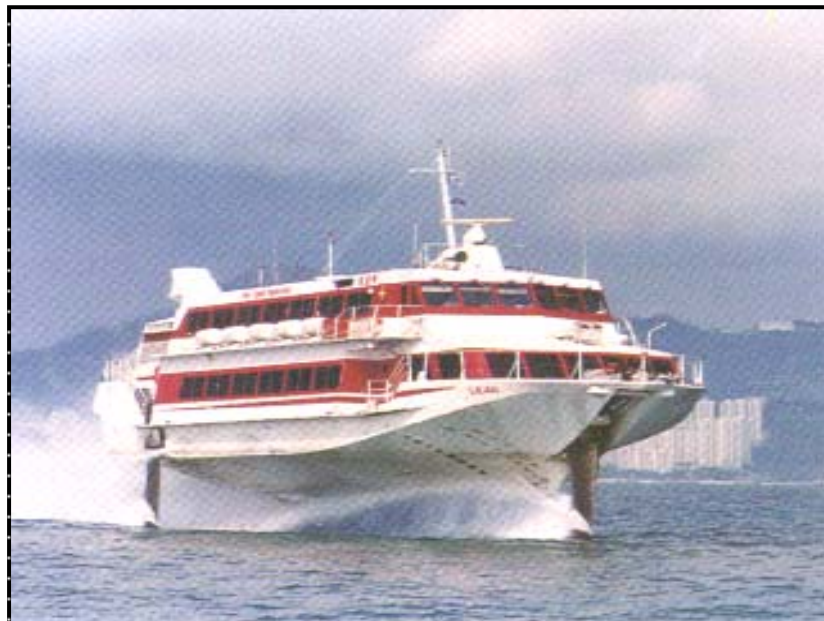
Fig. 2 : Photograph of Jetfoil similar to “Taipa”